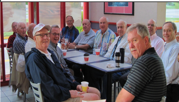
THE LAST SONRISE MEN'S PRAYER BREAKFAST.