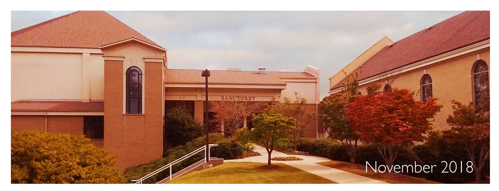
BLUFF PARK UNITED METHODIST CHURCH MONTHLY NEWSLETTER