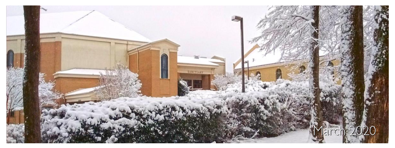
BLUFF PARK UNITED METHODIST CHURCH MONTHLY NEWSLETTER