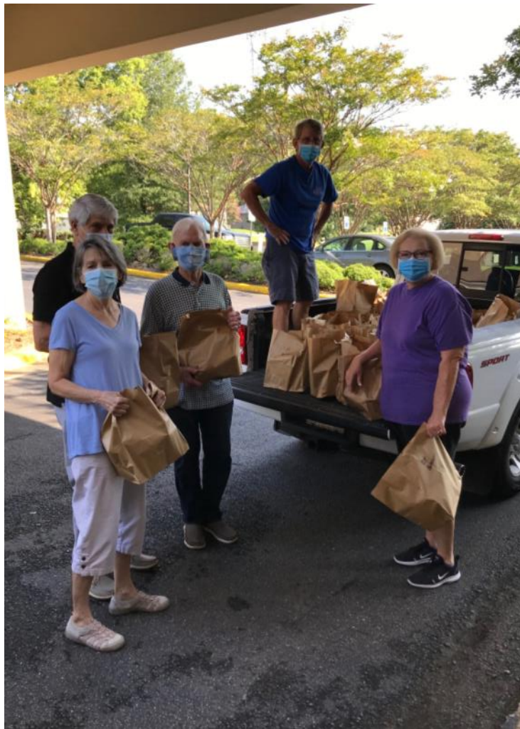
August Food Pantry: 248 Families Served and 6000 Diapers Distributed